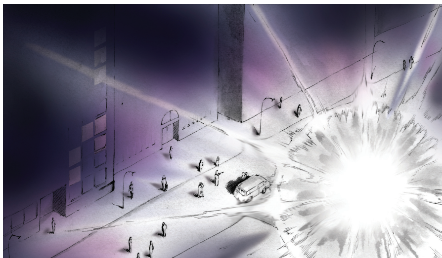
Biotech IPOs on US exchanges have been something to watch.

Another example is Alexion of Cheshire, Connecticut, which from 2011 through the third quarter of 2013, had stock growth of 185%, based on the potential of its blockbuster drug Soliris (eculizumab). Investors look for this sort of 'hockey stick' growth, but most public biotech firms such as these are already prohibitively expensive, which may be driving investors to the crop of young, innovative private companies in the hopes they follow a similar path.